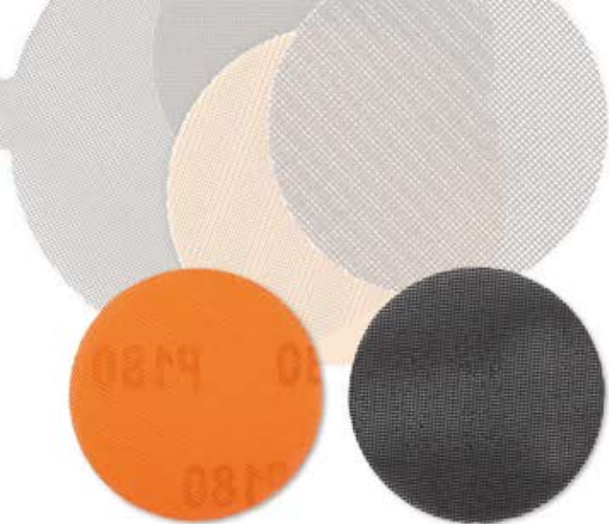
150mm 拉绒 橙色